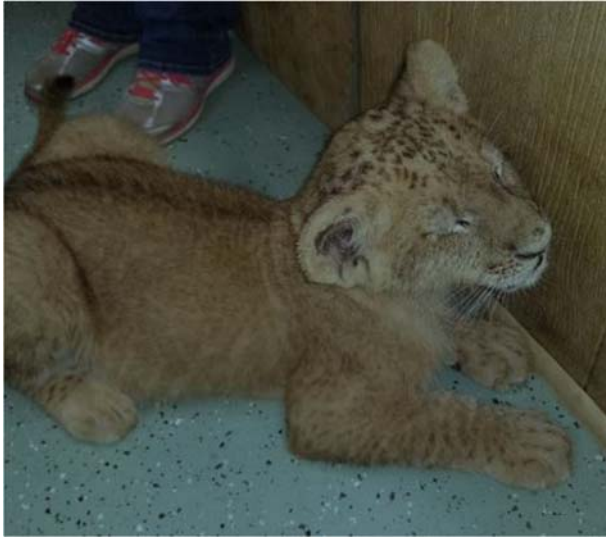
(Cub during Tiger Baby Playtime)

During Tiger Baby Playtime, however, they cannot sleep—often forced to interact with the public; they eat in an extremely stressful environment, sometimes in an unnatural position; and they cannot escape the public touching and petting them: